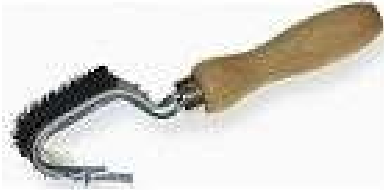
595 0021 Scratcher Brush Complete