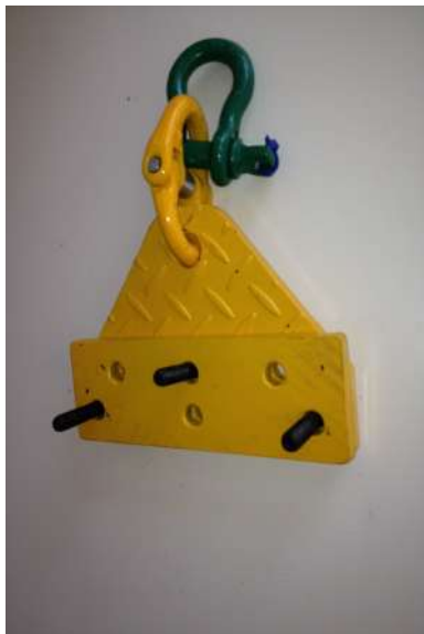
595 6235 Belt Pulling Plate 2.5 Tonne Rating