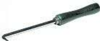
595 2122 Ply Lifter