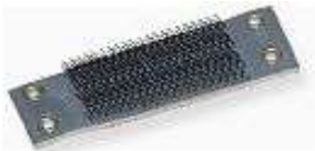
595 0038 Replacement Scratcher Pads