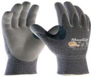
595 5110 Maxi-Cut Gloves