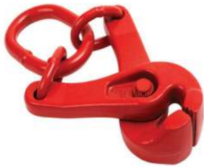
MINI-BSC-03 Mini Belt Stripping Clamp Safe Working Load – 3 T