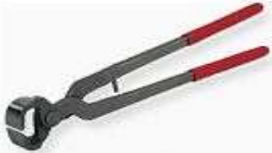
595 5550 300mm Knipex Pincers