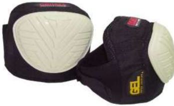
595 5160 Nailer G2 Gel Knee Pads